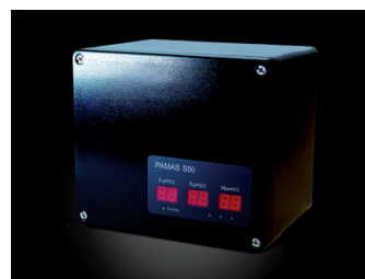
PAMAS S50P with integrated pump for pressureless applications

If the application supplies pressure, the unit can be operated without internal pump. PAMAS S50 continuously determines the flow rate through the sensor to achieve precise measuring results independent of the input pressure. The variable flow rate ranges between 5 and 50 ml/min. For pressureless applications, PAMAS S50 can be equipped with an additional pump ( PAMAS S50 P ). The wear resistant ceramic piston pump controls the flow rate to 25 ml/min at a pressure range from 0 to 6 bar.